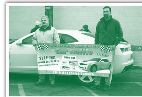
Over 78,000 tickets were sold for this year's raffle.